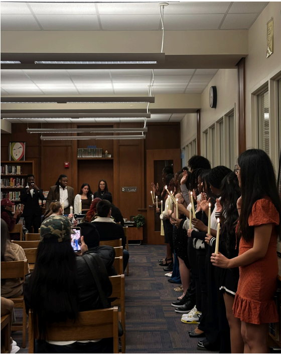
The NHS Induction Ceremony was held on November 20.