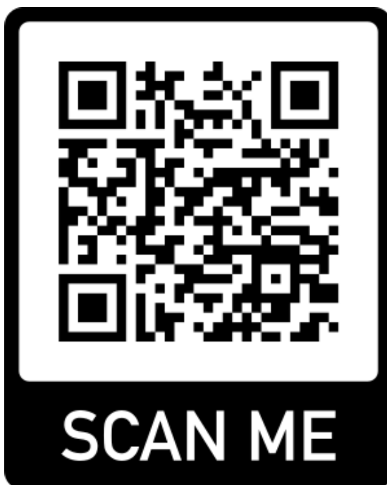
Scan QR code to honor your loved ones at the Hispanic Heritage Month assembly.