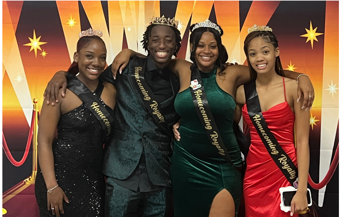
Student council hosted Hoco and replaced last year's Reigning Royals with Royal Families in 2024.