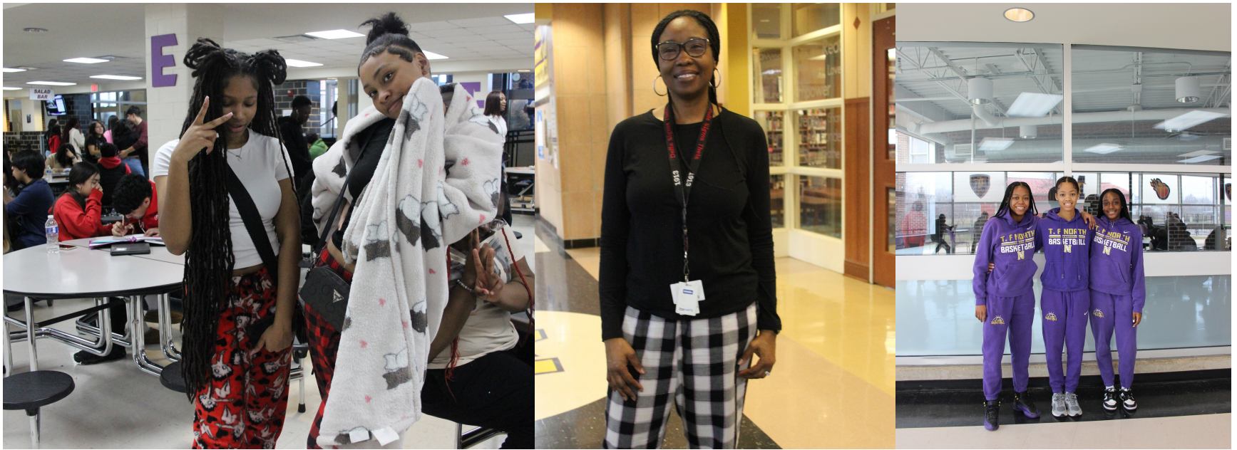
PJ Day and Twin Day photos provided by Vianka Guerra of the Chronoscope.